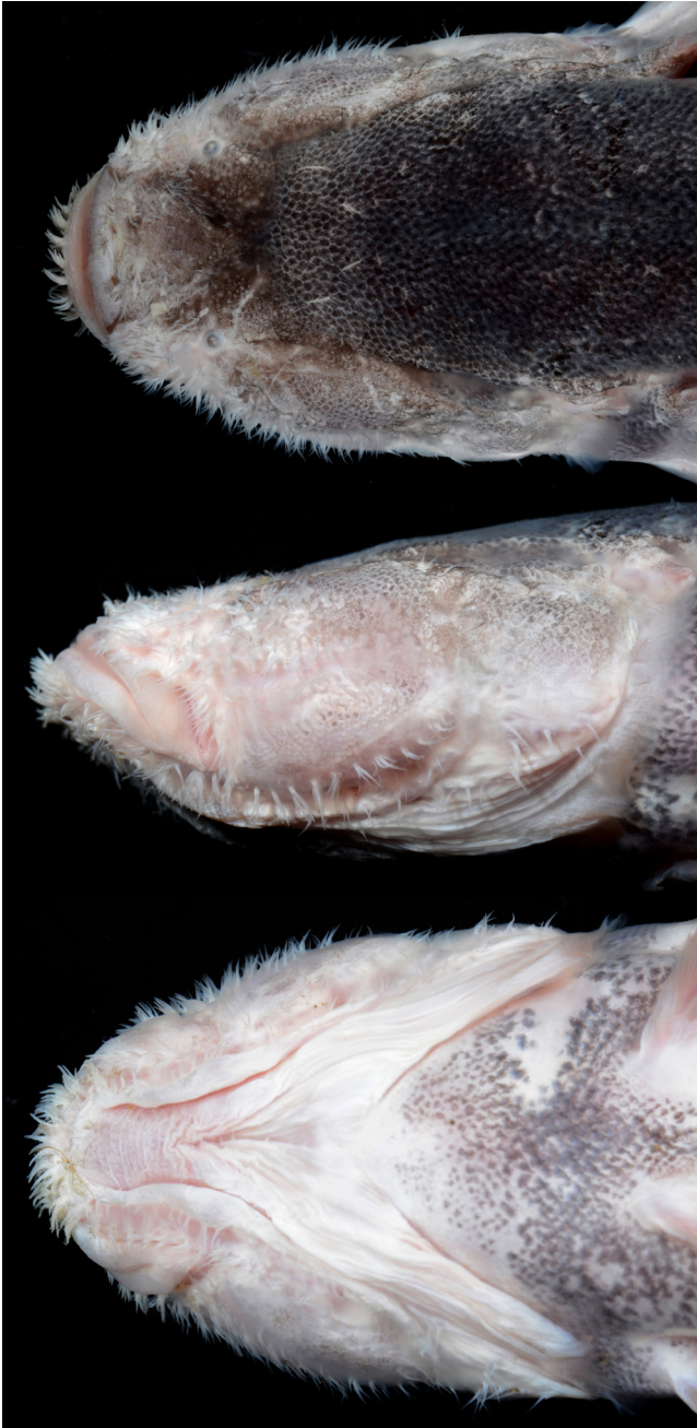
Fig. 2. Dorsal, lateral and ventral views (right side reversed) of head of fresh Pogoneleotris heterolepis (ZRC56949, 160.0 mm SL male); showing extent of scalation and sensory papillae.

Morphometric values of males and females are given in Table 1. See Figs. 1 and 4. Body cylindrical anteriorly, becoming compressed and narrower posteriorly, with slender caudal peduncle (Fig. 1). Head broad, depressed anteriorly, with nape variably humped; with low concavity or groove at leading edge of scaled area behind interorbital. Eyes very small, facing dorsally. Interorbital very wide, about 30% of head length. Jaws large (about 40% of head length), oblique, at about 40° angle to body axis, chin tip anteriormost. Tongue large, tip rounded to blunt. Mouth terminal, oblique, lower jaw prominent, jaws reaching back to before very small eye; lip lining fimbriate, fimbriae often branched. Teeth in both jaws in 5–8 rows, with about six large stout curved teeth widely spaced across front of jaw, with 5–6 rows of small conical teeth crowded behind; and innermost row of