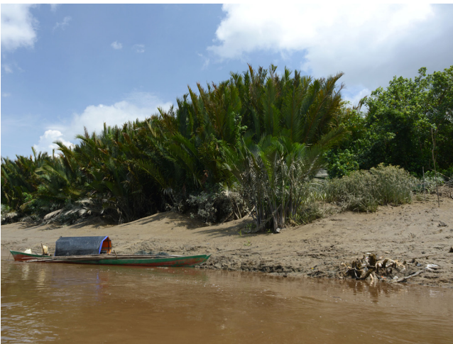
Fig. 5. Simunjan River habitat of this species; showing fishers' boat moored beside lines onto bank from gill net.

Remarks. It is commonly known as the bearded gudgeon, Ikan buccat butta or Batu betutu , and has been referred to as the Sarawak mud gudgeon. At the Rajang River delta, the local name in the Melanau dialect is Ilong mapak [=blind fish] (Tan & Grinang, 2018).