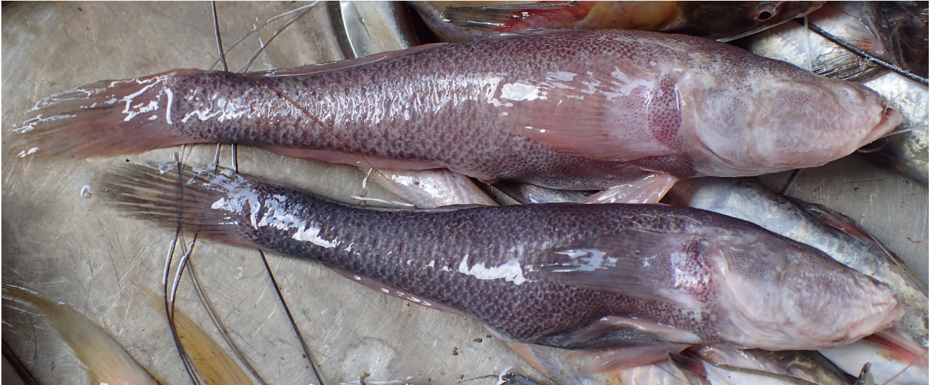
Fig. 4. Fresh Pogoneleotris heterolepis from Simunjan, Sarawak; ZRC56949, female above (166.7 mm SL), male below (160.0 mm SL).