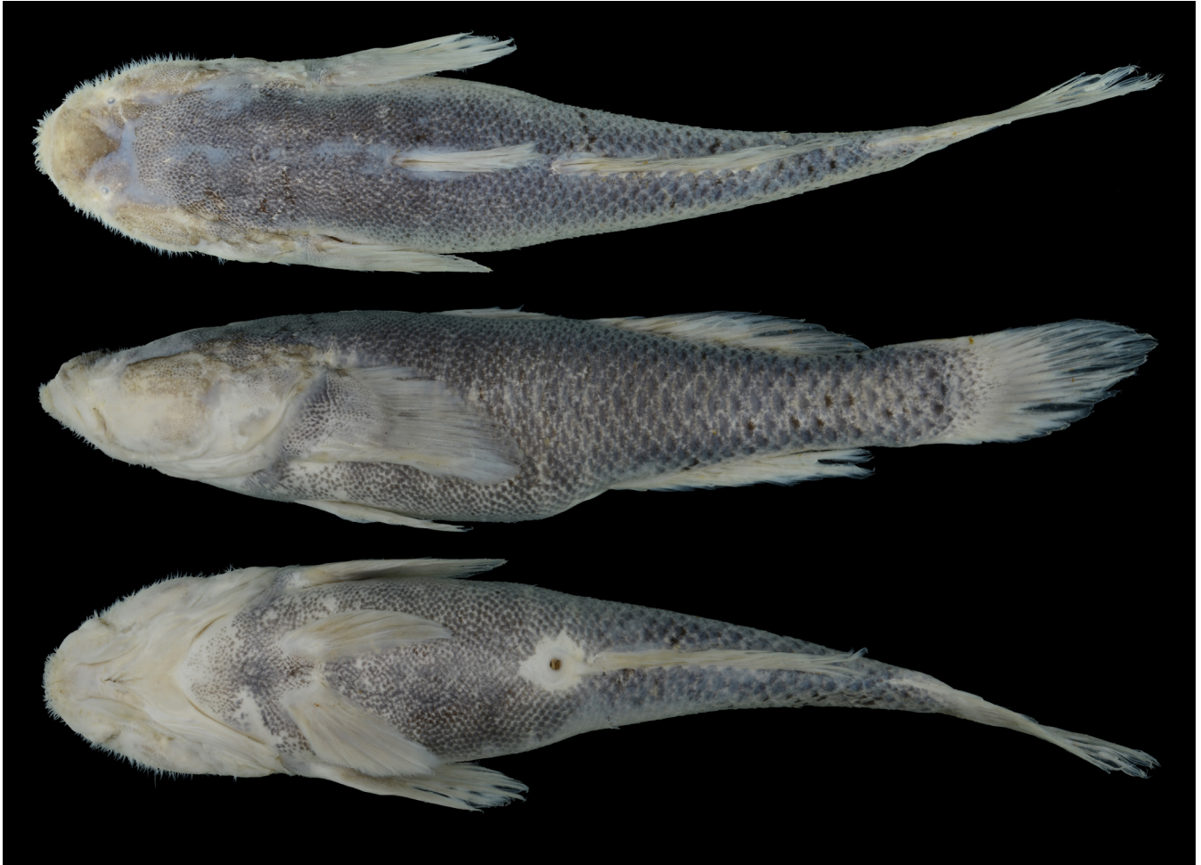
Fig. 1. Dorsal, lateral and ventral views of preserved male Pogoneleotris heterolepis (ZRC56949, 160.0 mm SL).

Pogoneleotris heterolepis – Bleeker, 1875: 107 (Borneo); Vinciguerra, 1926: 543, pl. 1; Koumans, 1953: 323; Tortonese, 1963: 342; Kottelat & Lim, 1995: 247; Larson in Randall & Lim, 2000: 639; Larson & Murdy, 2001: 3577; Parenti & Lim 2005: 194; Atack, 2006: 167; Kottelat, 2013: 395; Tan & Grinang, 2018: 203–210.