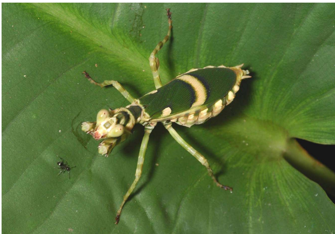
Fig. 3. Dorsal view of gravid female from Bukit Timah Nature Reserve. Note the characteristic 'smiley face' pattern on its wings.

In the Upper Peirce Reservoir forest, another female was sighted and photographed by Francis Seow-Choen on 5 Aug.2008. In Bukit Timah Nature Reserve (BTNR), an adult female (body length 40 mm) was discovered by the second author on 17 Jun.2008. Upon closer inspection, its abdomen was observed to be heavily distended and suspected to be a gravid individual (Fig. 2). From the dorsal view, a characteristic pattern of the typical 'smiley face' was clearly visible (Fig. 3).