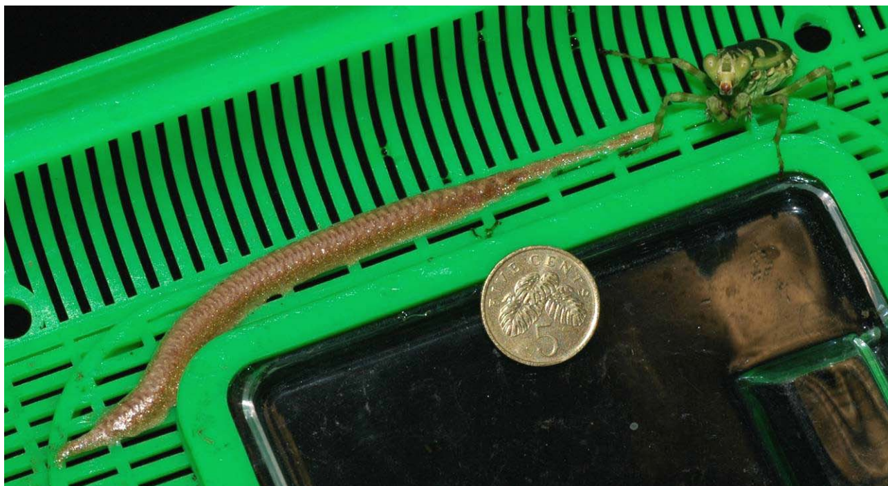
Fig. 4. Female guarding her clutch of freshly laid eggs within an elongate ootheca. The ootheca was 90 mm long. Photographed on the morning of 26 Jun.2008.

The female mantis was then reared in captivity and nourished with a diet of wild-caught, orthopteran prey, including small crickets, grasshoppers, and katydids. On the morning of 26 Jun.2008, the female was found to be standing guard beside an elongated strand of freshly deposited eggs. Oviposition was suspected to have either occurred the night before, or in the pre-dawn hours. The eggs within an ootheca were laid on the underside of the lid of the plastic aquarium in which the female was housed. The beige ootheca was 90 mm long with a uniform width of 5 mm, and tapering at both ends (Fig. 4). The female was then promptly released back to its original locality.