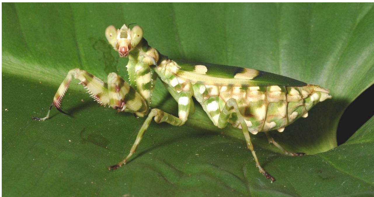
Fig. 2. Gravid adult female (body length: 40 mm) from Bukit Timah Nature Reserve. Note the significantly distended abdomen.