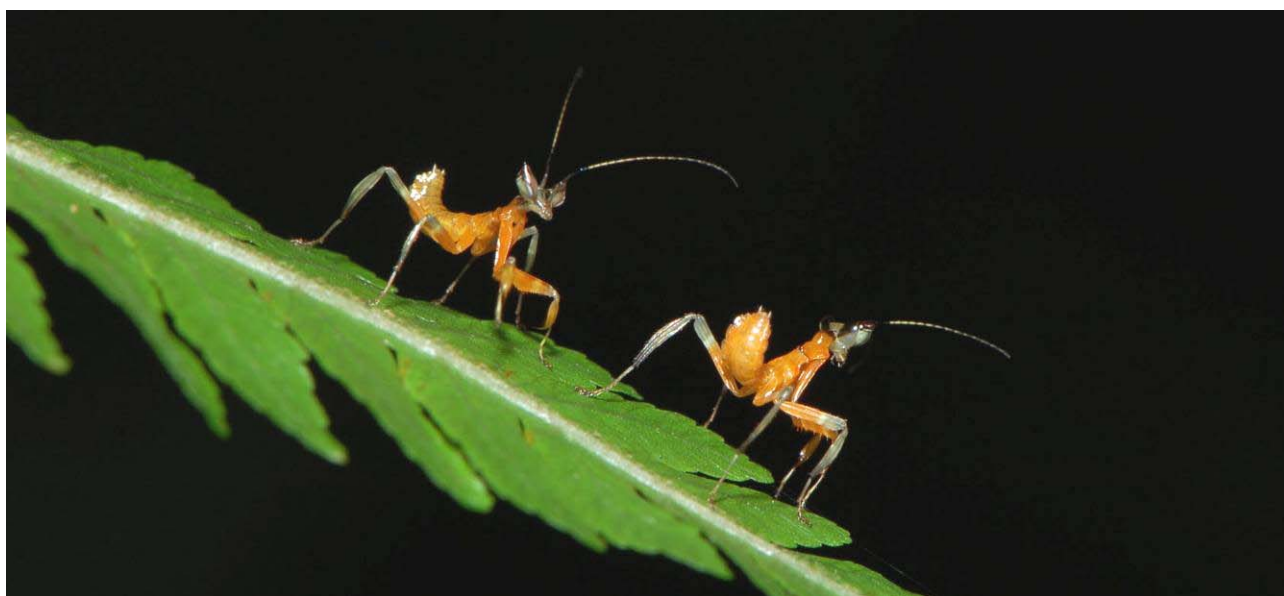
Fig. 5. Newly emerged hatchlings (body lengths: 6–7 mm) survey their surroundings, shortly after being released at Bukit Timah Nature Reserve on 26 Jul.2008.

On the evening of 24 Jul.2008, the entire batch of about 120 eggs hatched sequentially. Each hatchling was approximately 6–7 mm long. Unlike their parents, they were a deep orange. Their abdomens were arched upwards, as is typical of mantid nymphs (Fig. 5). The next morning, the hatchlings were released into the forest of the BTNR. A few representative voucher specimens were preserved, together with the corresponding empty ootheca, and deposited at the Zoological Reference Collection (ZRC) of the Raffles Museum of Biodiversity Research (ZRC.6.20944).