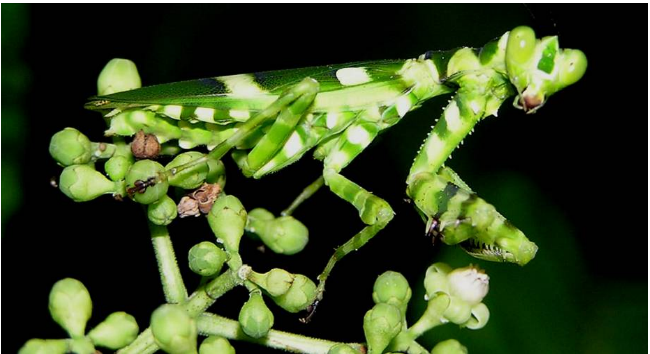
Fig. 1. Adult female Theopropus elegans on the inflorescence of Leea indica at Bukit Kallang, Central Catchment Nature Reserve on 29 Jun.2006.

Within the existing forested habitats of the Central Nature Reserves, Theopropus elegans has been sighted in various localities. In the MacRitchie Reservoir forest, an adult female was observed to be perched atop the flowers of a local shrub, Leea indica (Family Vitaceae) by Ngon Soon Kong (National Parks Board) on 29 Jun.2006 (Fig. 1). This female had a relatively flat abdomen and may have been seeking prey to hunt, such as unwary butterflies (Lepidoptera) or bees (Hymenoptera) visiting the inflorescence. This same individual was observed on the same shrub the next day.